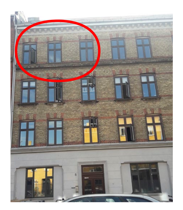
Figure 1. Thomas Laubs Gade 5, with indication of renovated apartment.

parts of the façade by 60 % of the original value. The U-value of the walls at the upper floor after internal insulation is thus changed from 1.49 W/m<sup>2</sup>K to 0.59 W/m<sup>2</sup>K, and at the lower floors from 1.19 W/m<sup>2</sup>K to 0.53 W/m<sup>2</sup>K (Figure 2).